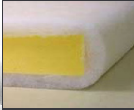
FIBER WRAP SEAT CUSHION

NA Comfort fill is a unique, proprietary blend of down, feather and fibers specially formulated by our design team to mimic the feel of down while maintaining the crisp clean look of Nathan Anthony's original designs.