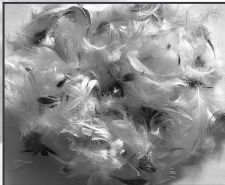
NA COMFORT FILL

Trillium cushions are made of man-made polyester fibers that mimic the feeling of down. The fibers are denser and heavier and work in unison giving them great elasticity. There is no foam in our back cushions with a small exception to some designs.