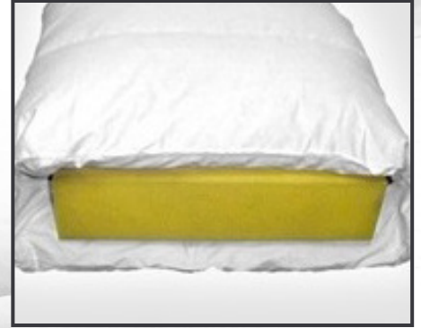
ENVELOPE WRAP SEAT CUSHION

Foam core 2.5 pound density foam (yellow) with fiber wrapped around (white)